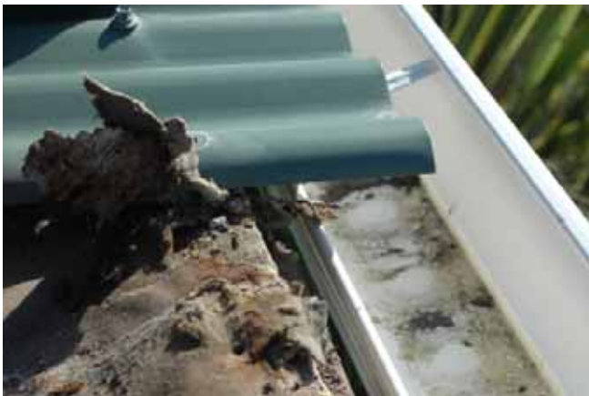
Gutter is installed incorrectly, paper has been rotted away, netting has rusted away, ARX™ has been perforated as a result.