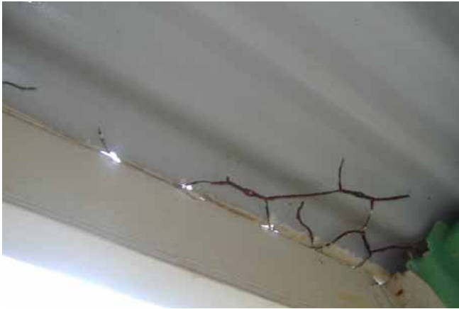
Paper has rotted away, netting has corroded, ARX™ has perforated as a result.