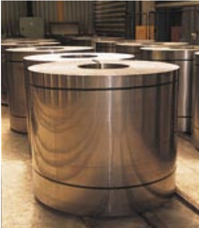
Cold rolled coil.