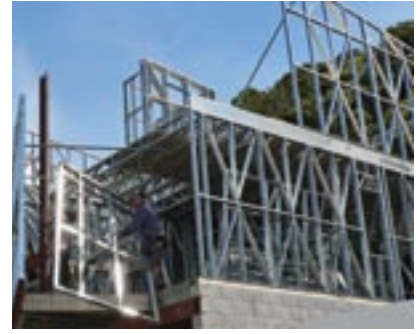
AXXIS™ Steel for Framing makes for a healthy home.

New Zealand Steel is constantly conducting research for product improvement,